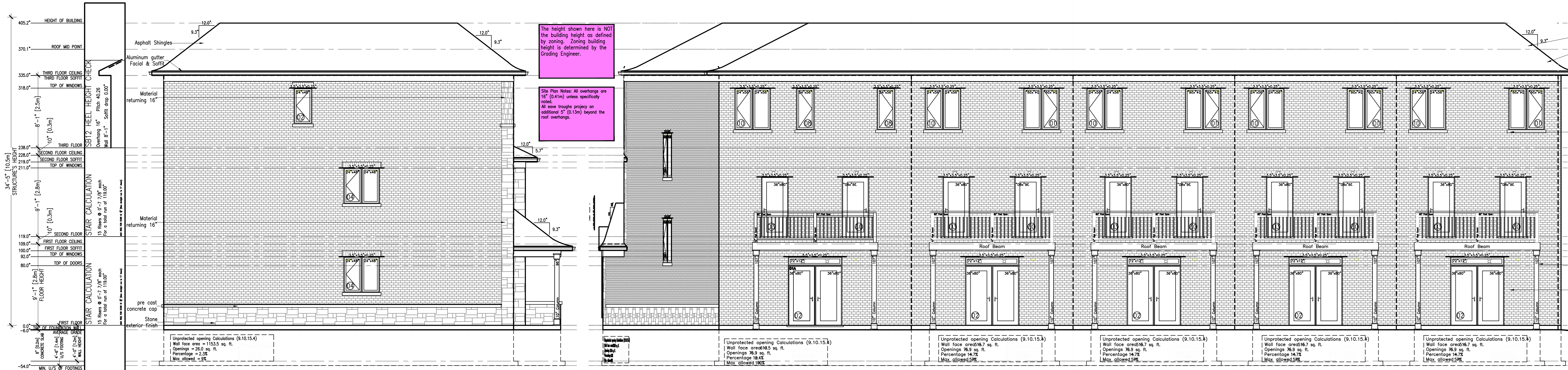
A Left Side Elevation V01 SCALE 3/16" = 1'-0"

ANCASTER, ONTARIO Elevation: REAR Unit No.: 06 Unit type :